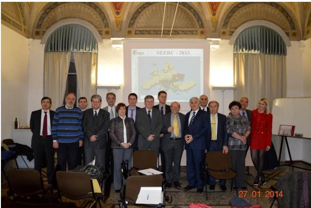
Delegates of the first SEERC meeting in Rome